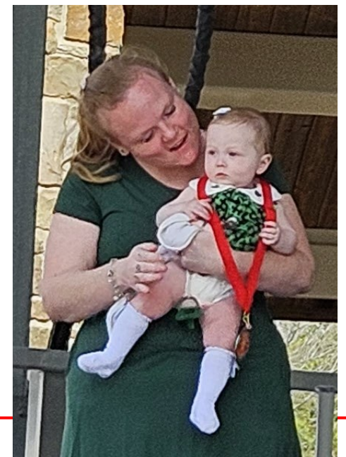
Redhead Competition Winner