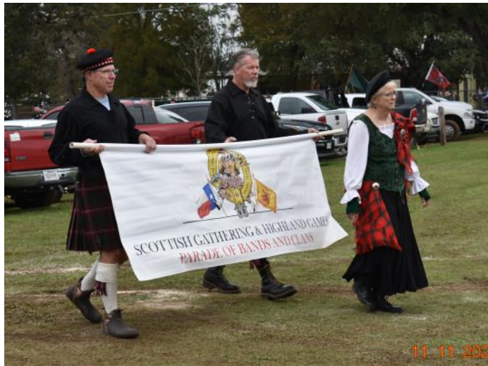
Opening Parade of Bands and Clans Let the games begin!