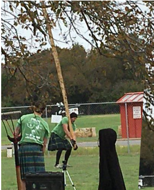
Up and balanced...