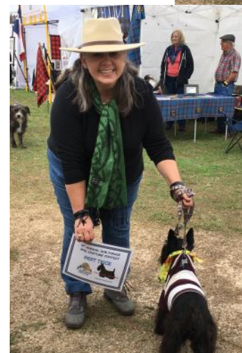
Honorable Mention, Best Trick